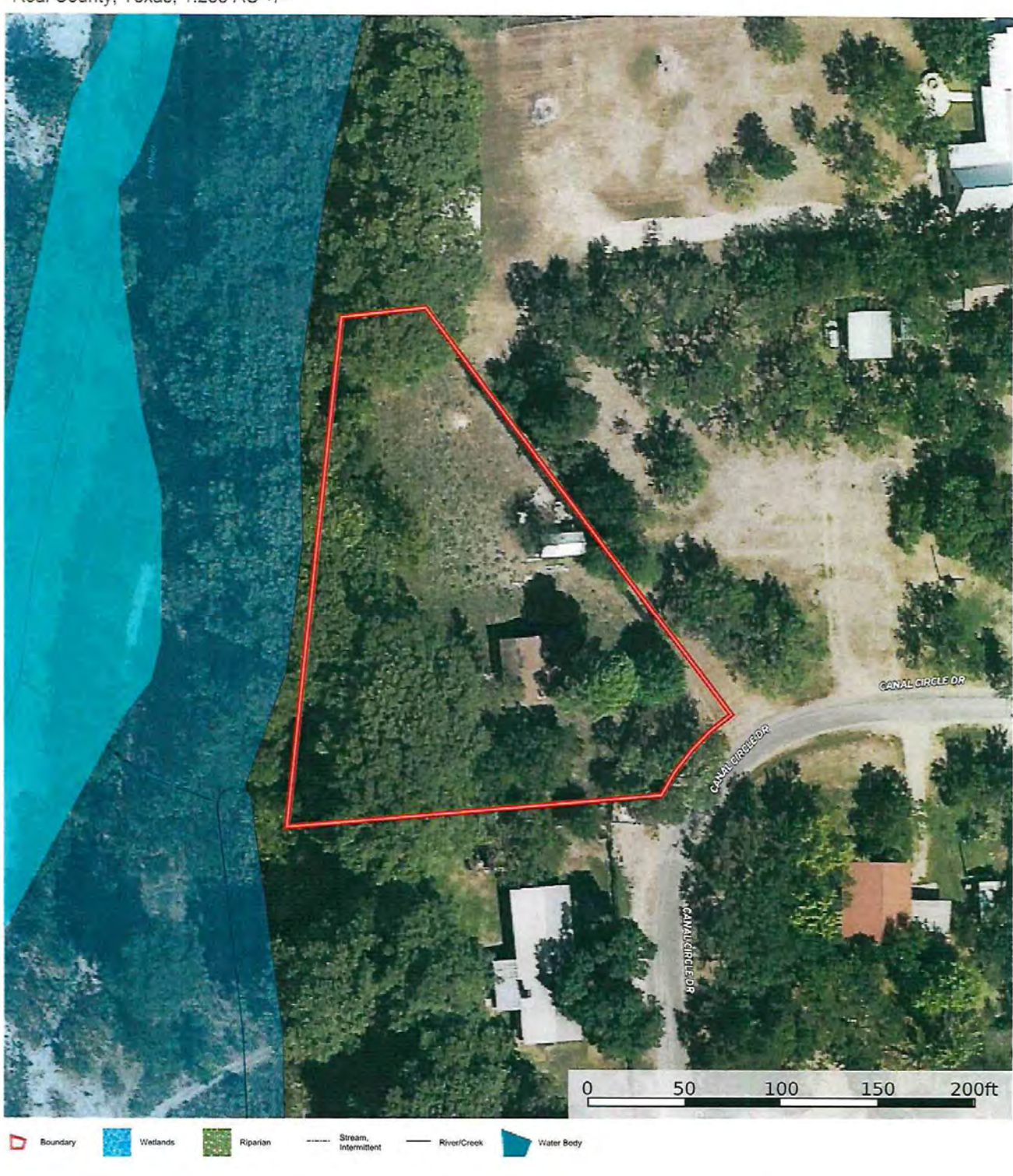
64 Canal Circle Real County, Texas, 1.235 AC +/-