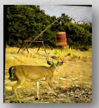
"Your Real Estate

Prop #6 Lot 45, Leakey Hills, 28.62 Ac Leakey, Tx 78873